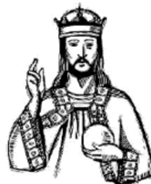
CHRIST THE KING

The puzzle is based on Luke 23:33-43 (NIV).